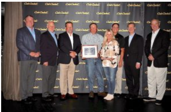
The team from Action Equipment Center receives 2019 National Retailer of the Year award from Cub Cadet.

The single location award recipient, Action Equipment Center , is a family-owned and operated agricultural and residential power equipment dealer, providing Washington and Greene counties (PA) with the latest and best in power products to make outdoor living more enjoyable. With a full line of parts, a stocked showroom and superior service from friendly and knowledgeable staff, Action Equipment Center is a one-stop shop for all of outdoor power equipment and lawn and garden supplies.